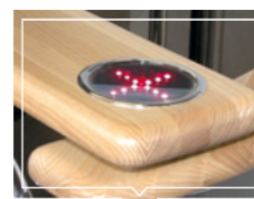
LED indicators at wooden rails of RTD-03S turnstiles

The warranty period is 5 (five) years from the date of sale of the product.