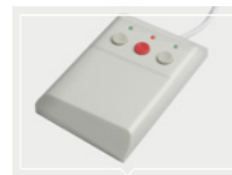
Control panel for remote management